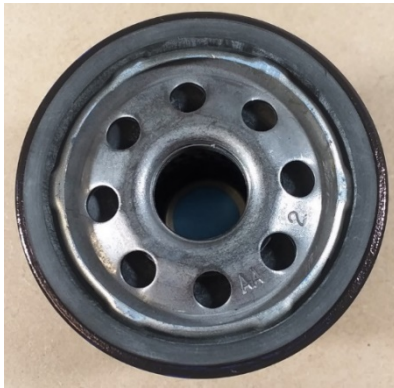
The current OF4477, OF4477BP, HP4477, & WPH2878 filters used a common backplate which incorporated a standard spiral locked core within the filter media.

Part Number Consolidation: Toyota has updated the recommended oil filter on applications previously using WPH2878 (OF1411). The new recommendation from Toyota will allow the elimination of WPH2878 and consolidate the applications into OF4477 / WPH2840. Either filter is acceptable on the listed applications and covered under our warranty. Additionally, the OF4477 filter will be undergoing an upgrade (illustrated below) as a running change over the next few weeks. Please update your application software as soon as possible from your data provider.